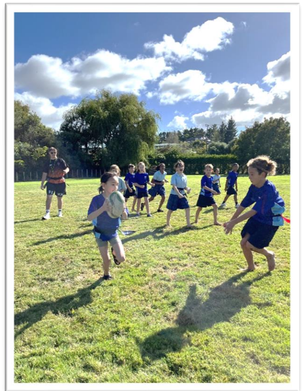
Visiting Harold the giraffe in the Life Education bus that visited recently. Games of Rippa Rugby