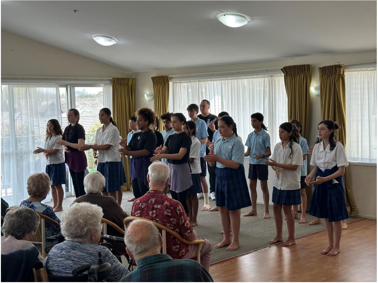
Kapa Haka performs for the residents