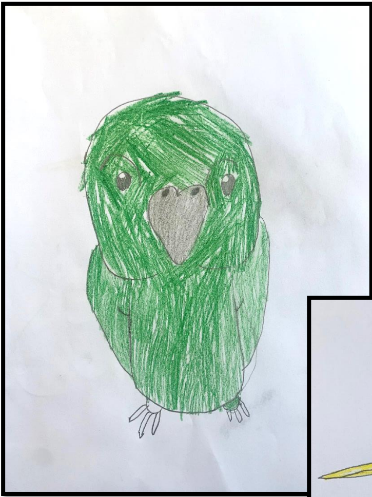
Kakapo - Myles