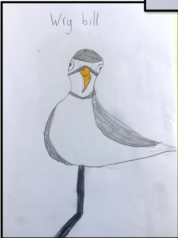
Wrybill – Lia