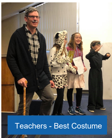
Teachers - Best Costume