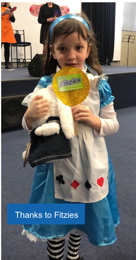
Thanks to Fitzies